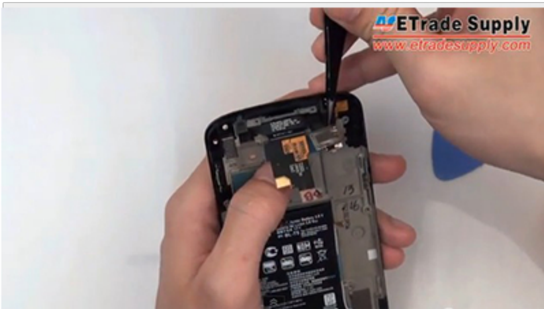
09 6. Use a Pair of Tweezers to pry out the vibrating motor and ear phone