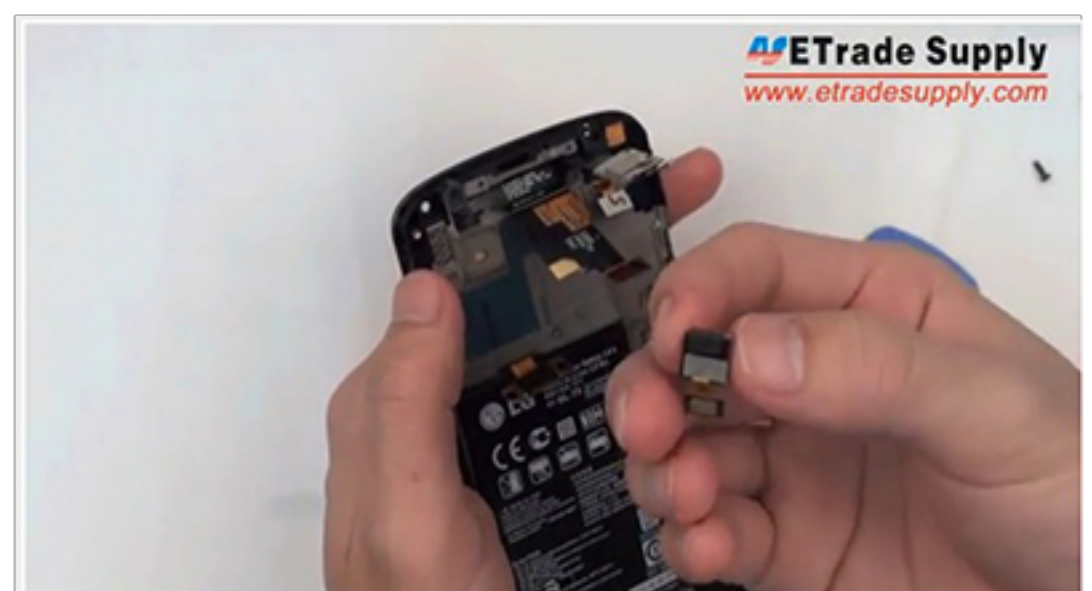
14 10. Remove the front facing camera and rear facing camera