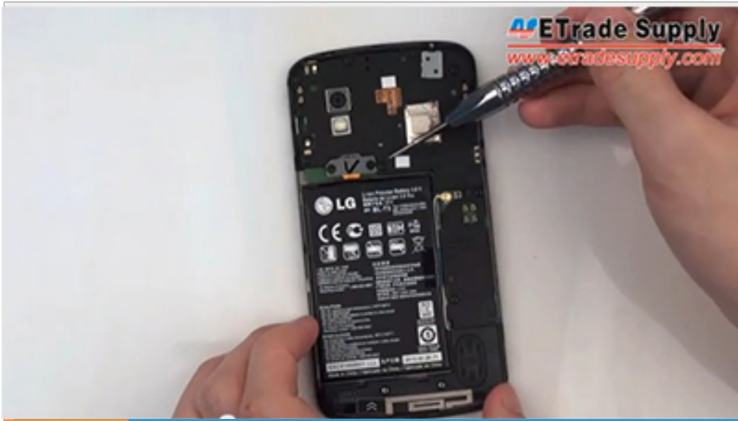
07 4. Use Small Phillips screwdriver to remove 13 screws on the rear housing.