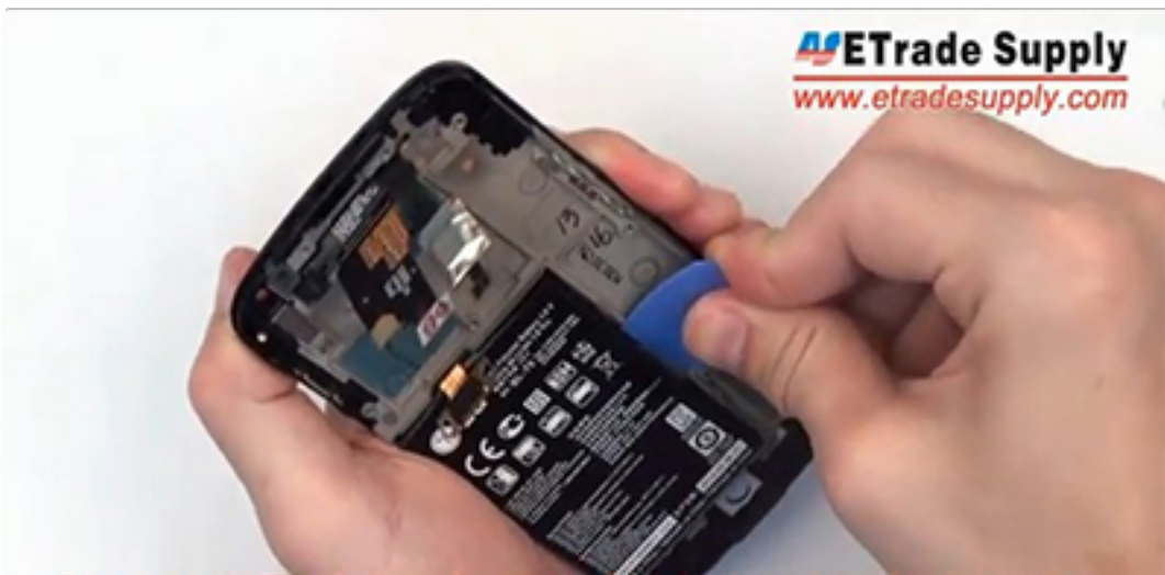
17 13. Remove Battery Please note: The battery is adhered to the front housing by strong adhesive. Prying up the battery with too much strength could break