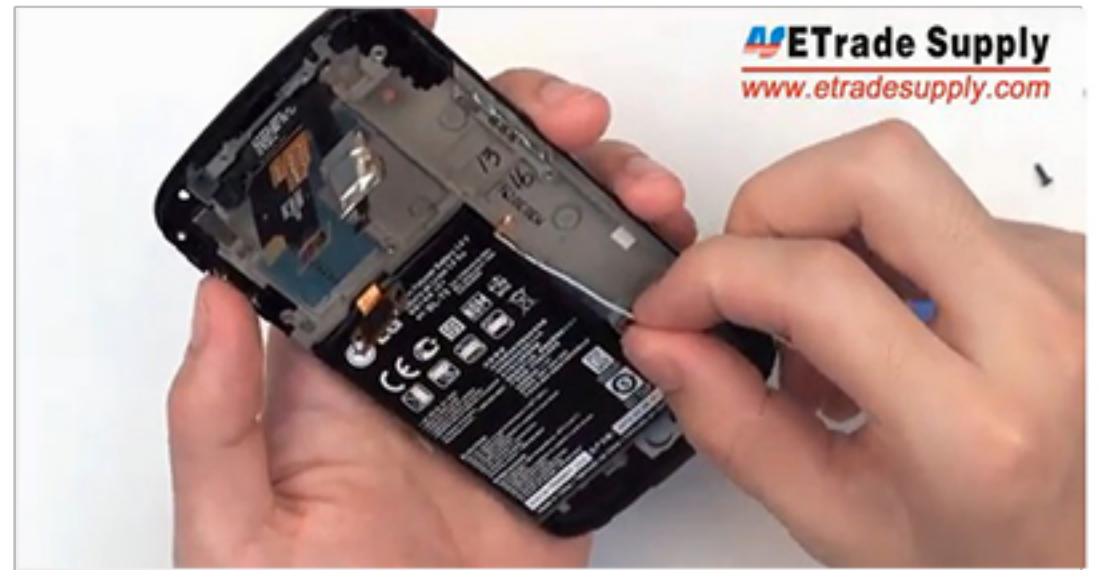
16 12. Take out the antenna and side keys