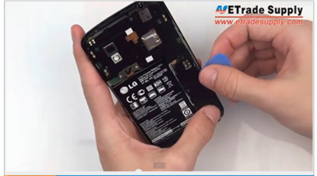
08 5. Use case open tool to remove the rear housing