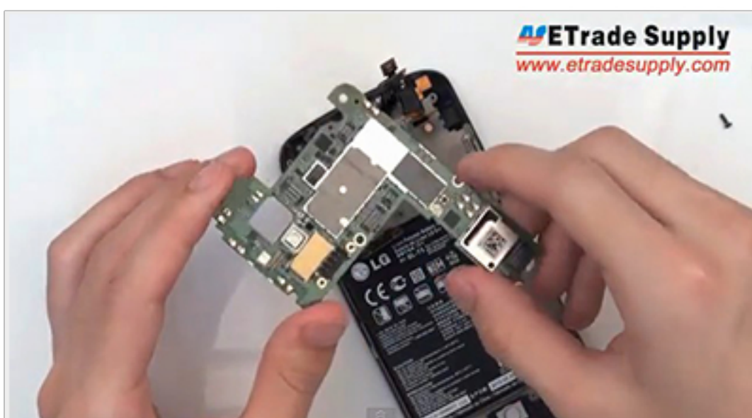
13 9. Remove the motherboard