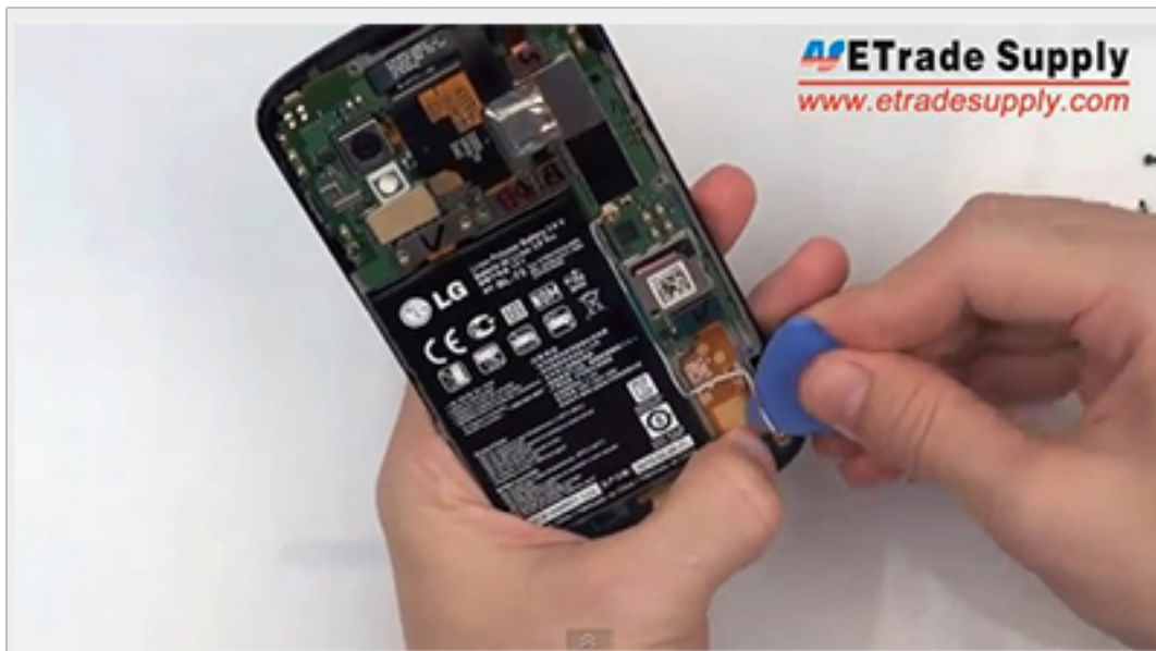
11 8. Disconnect all connectors on the motherboard