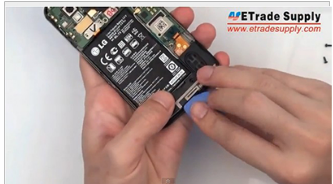
10 7. Carefully pry out the loud speaker module