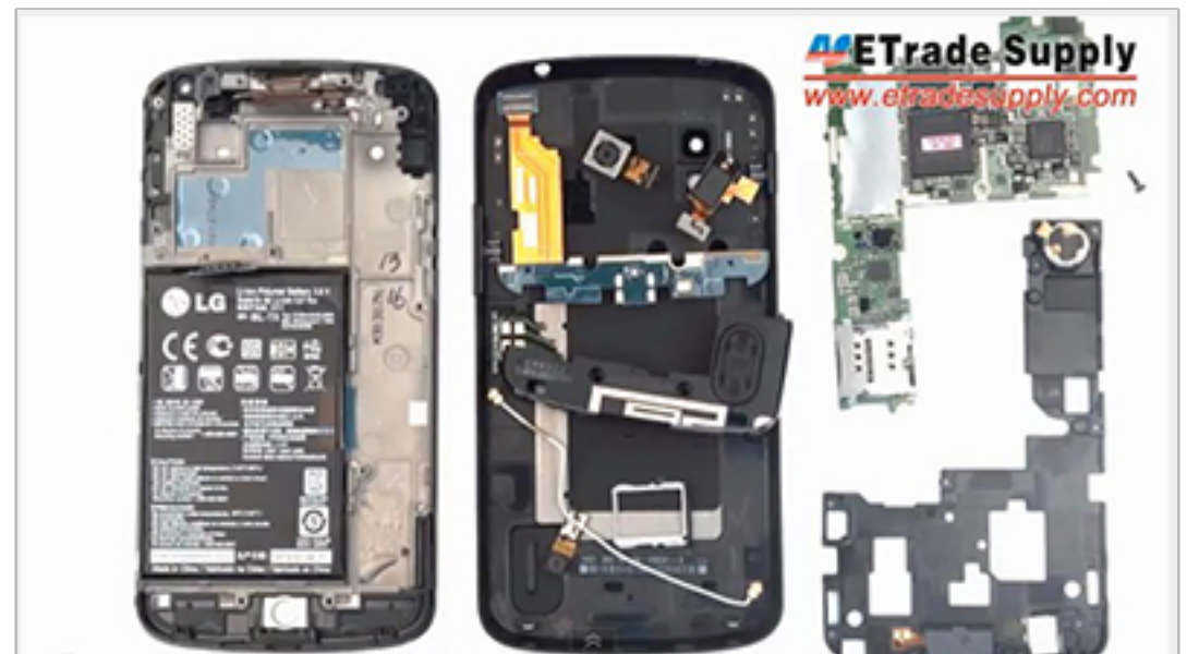
18 14. Tear down Nexus 4 parts