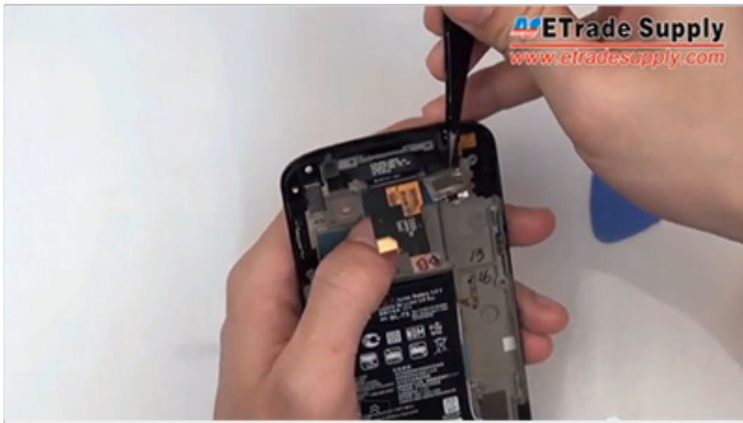
15 11. Pick out the head phone jack flex cable