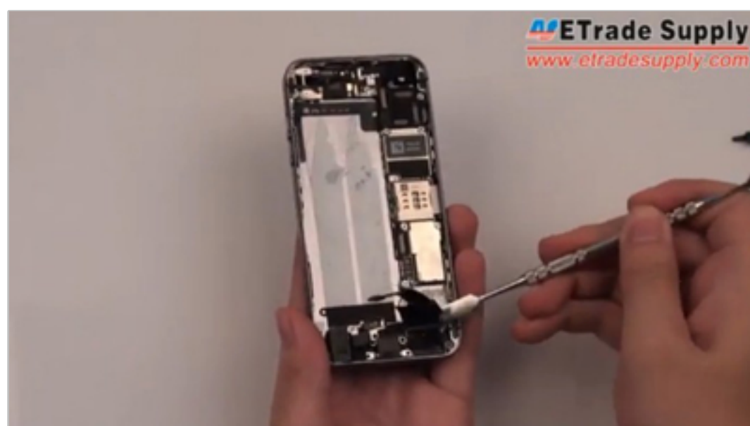
11 Remove the charging port flex cable