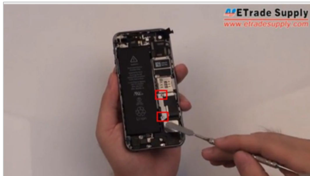
08 Undo 2 screws to remove the retaining bracket.