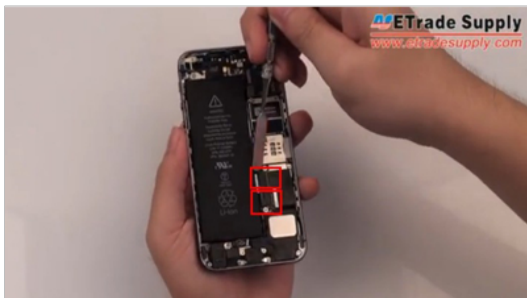
09-1 Disconnect 2 connectors