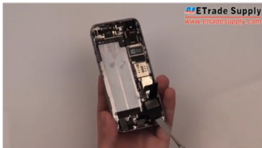
10-2 then pry up the loud speaker