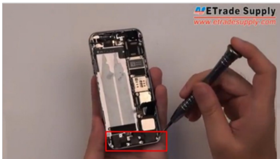
10-1 Undo 7 screws,