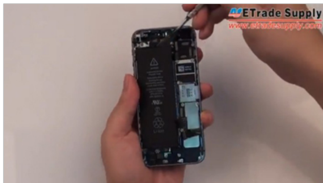
09-2 then pry up the battery. The battery is stuck firmly on the rear housing by the glue. Use the cellphone spudger tool to carefully pry the battery.