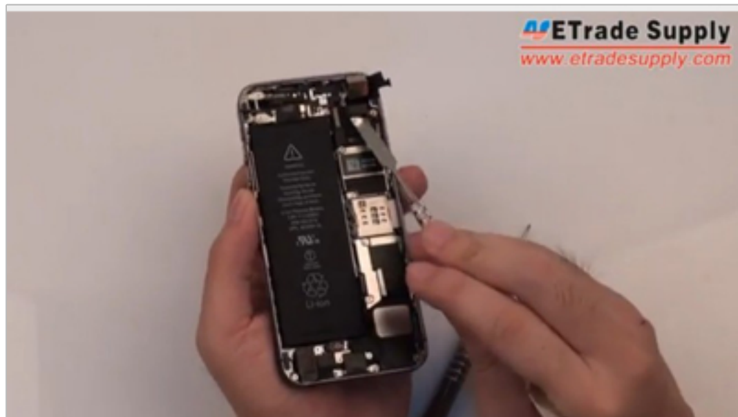
07 Disconnect a connector to remove the 5S rear facing camera